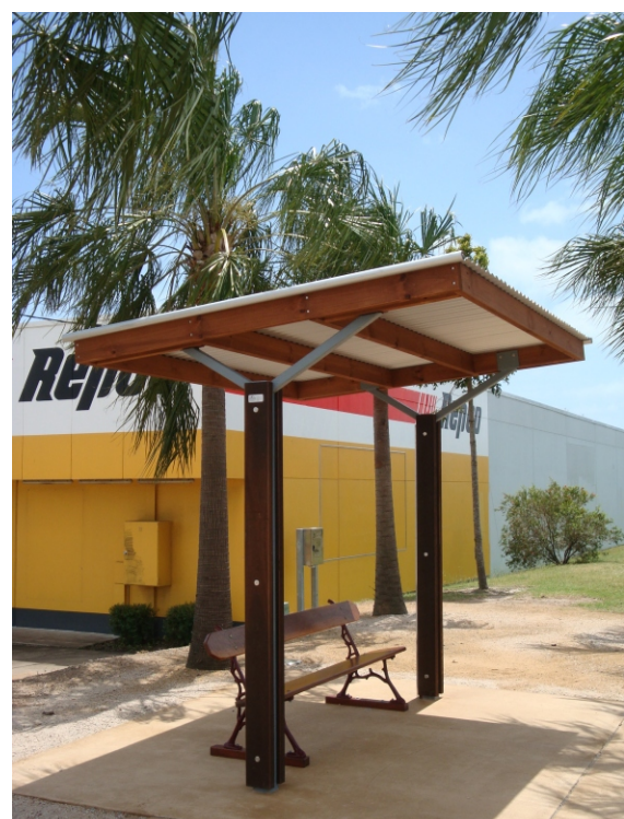
Standard model with hardwood post leave option