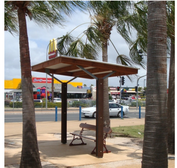
Standard model with hardwood post leave option