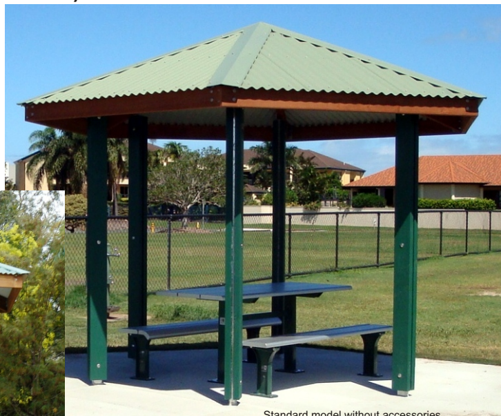
Standard model without accessories