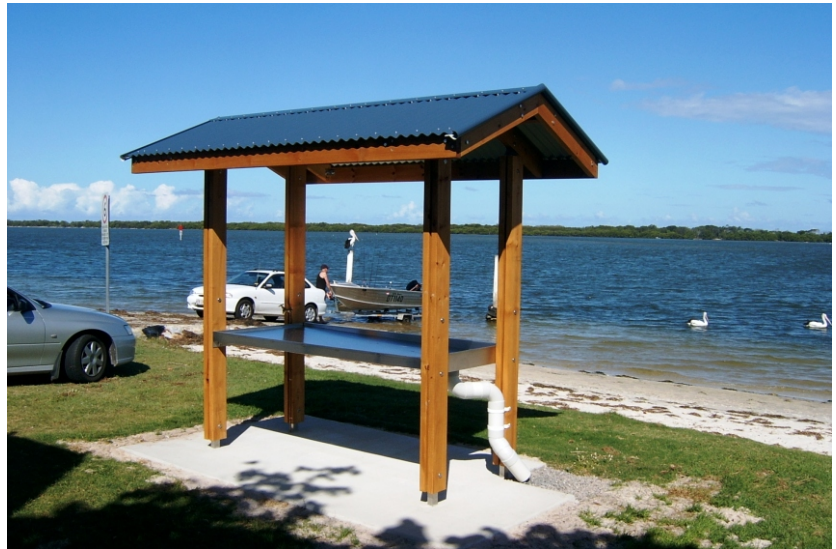
Standard model with roof