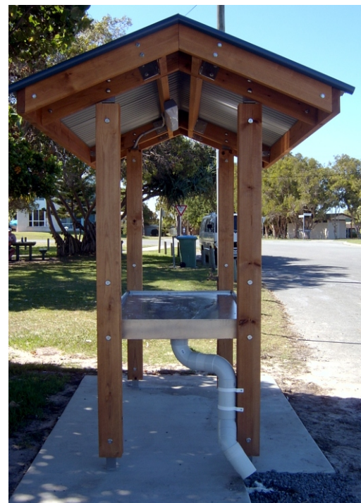
Standard model with roof