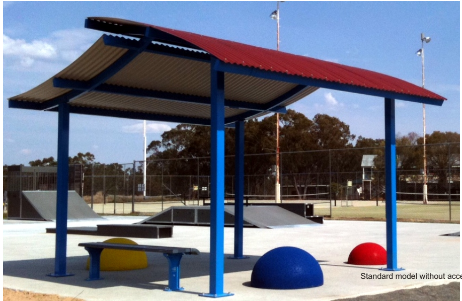
Standard model without accessories