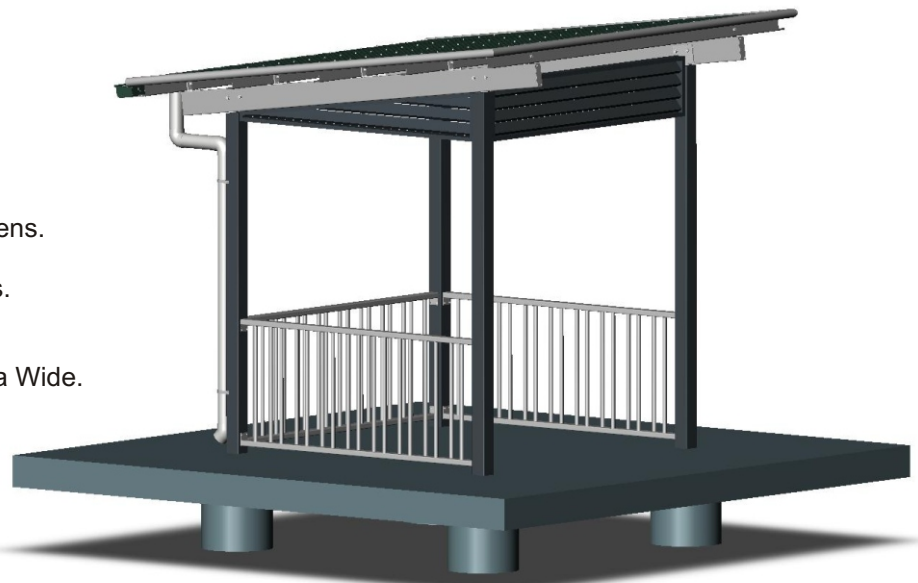
Image shown with accessories