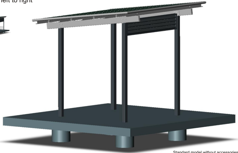
Standard model without accessories